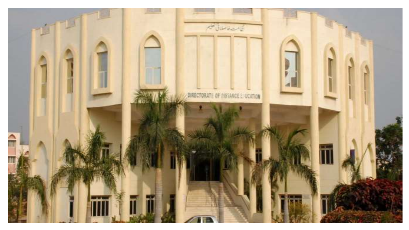
Directorate of Distance Education Building